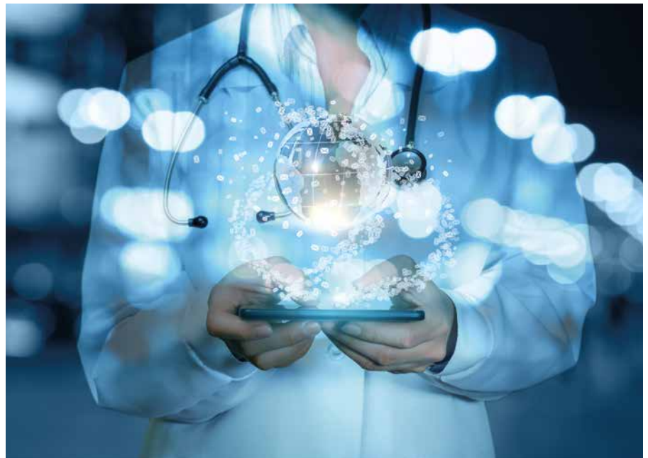
Digital technology can enable pathology departments to deliver more streamlined services; make case reporting more efficient and close the gap between case formulation and treatment delivery.

Bringing this digital workflow to pathology practices in the UK, Source LDPATH founded its digital pathology platform in 2014, with a vision of a virtual histopathology department for every NHS trust in the UK. In 2022, Source BioScience acquired LDPATH to form a pioneering platform for nationwide hospital trusts to make the